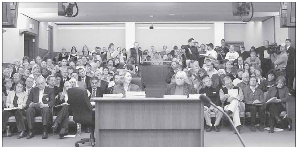
Before a packed committee room, the House Civil Law Committee approved a bill March 9 proposing a constitutional amendment that, if approved at the polls in November, would limit the definition of marriage to that between a man and a woman.

The bill's Senate companion (SF2715), sponsored by Sen. Michele Bachmann (R-Stillwater), awaits committee action.