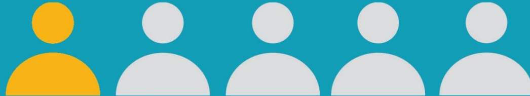
1-IN-5 WHITE HOUSEHOLDS