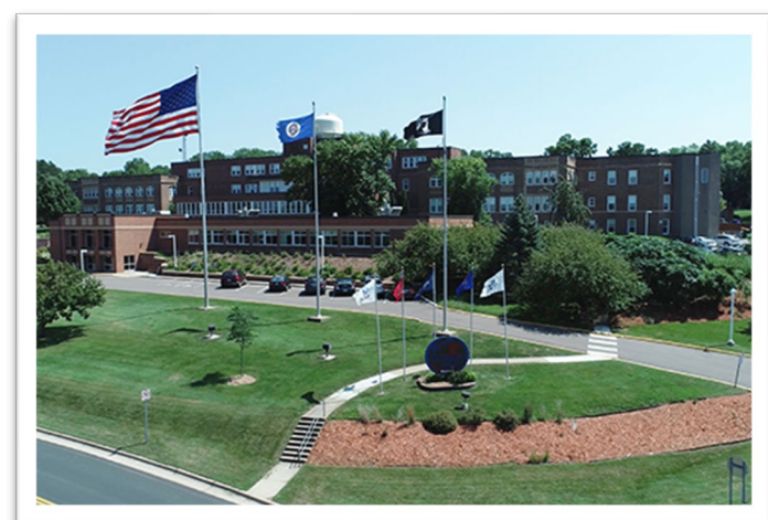
Minnesota Veterans Home-Hastings