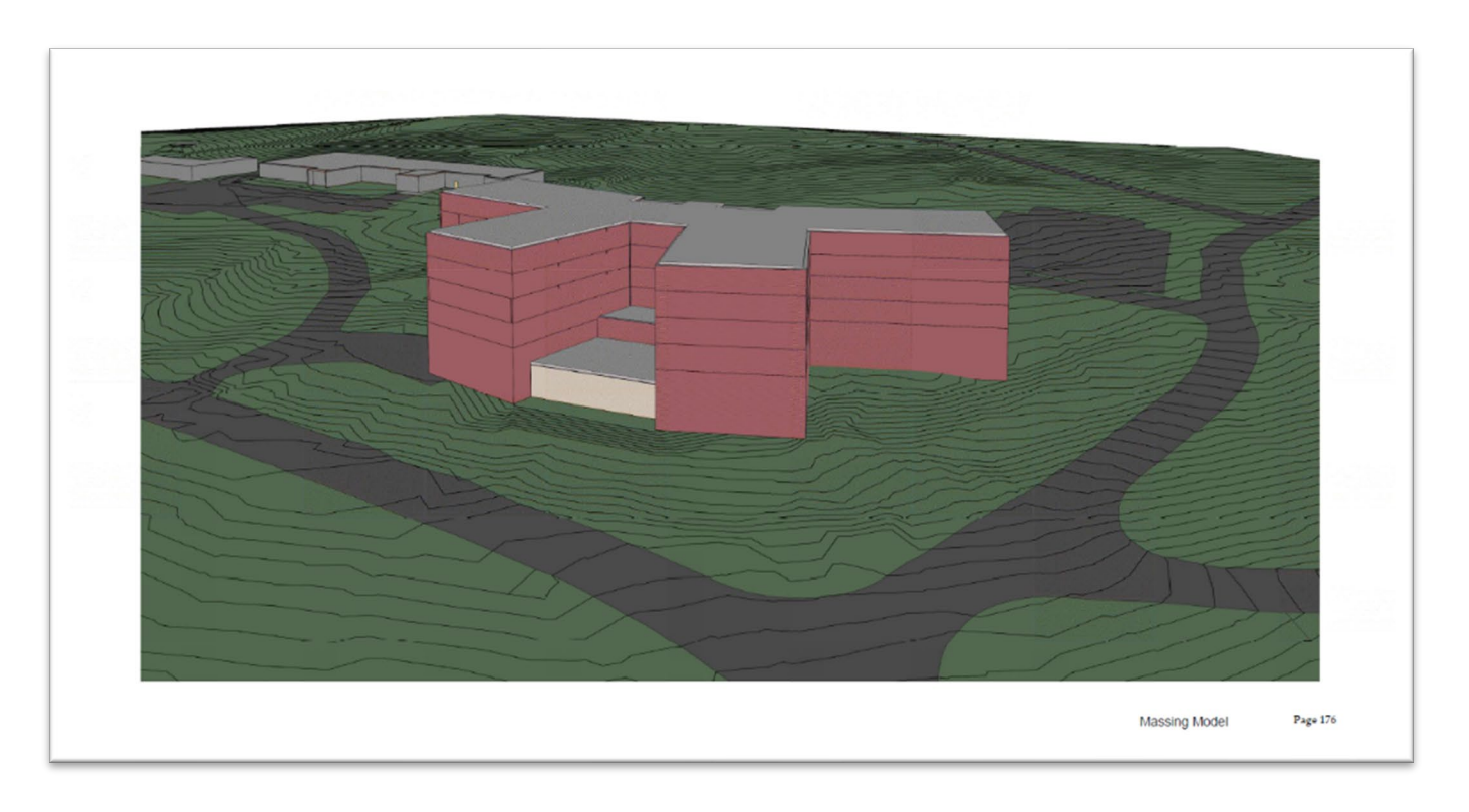
Final Exterior Elevation Rendition

• The project timeline is 42-months for all phases including predesign, design, site-preparation, demolition & construction