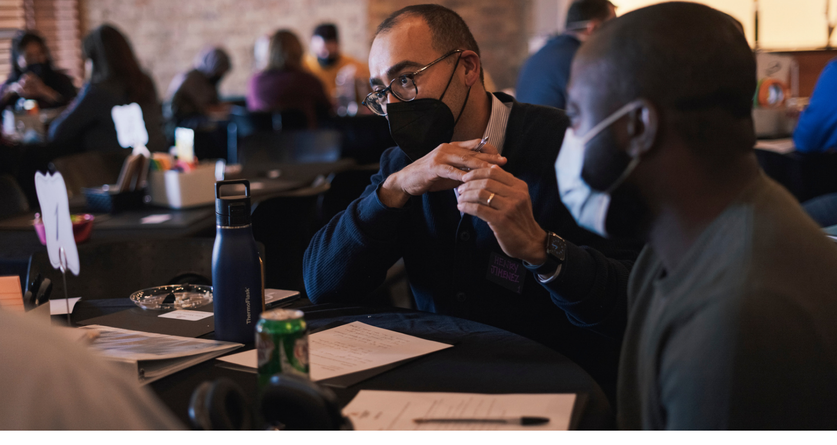
GROUNDBREAK WORK GROUPS, FALL 2022