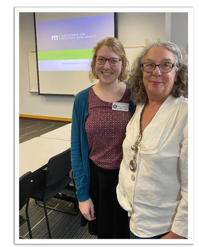
Draft plan listening session in Bemidji Co-hosted by Kairos Alive (DCC)