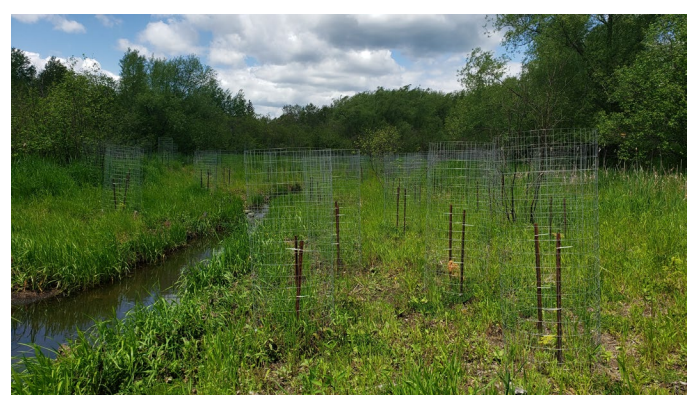
Tree planting and protection along a creek in Duluth.