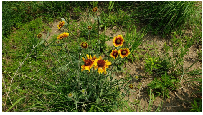
Rare Great Blanket Flowers in bloom at a restored prairie in Otter Tail County. Project by: Minnesota Land Trust.