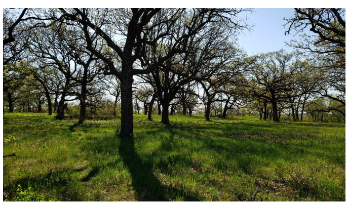
A restored oak savanna cleared of invasive species in Carver County. Project by: Minnesota Valley Trust, Inc.