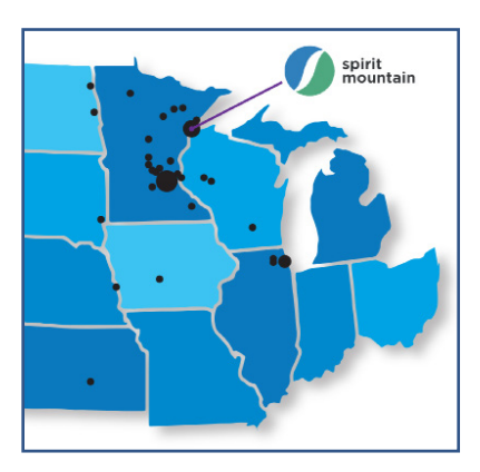
*For the period Fall 2020 to Fall 2021