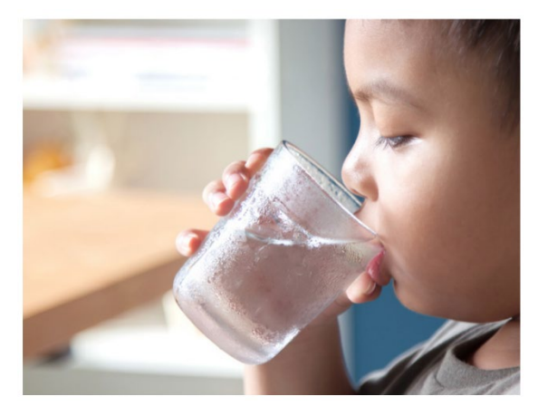
Emerging research links neonic exposures to elevated risk of developmental and neurological damage in humans, particularly in infants and young children.

People are commonly exposed to neonics through food and water.<sup>61</sup> Conventional chlorination alone, without carbon filtration treatment, generally fails to remove neonics from drinking water.<sup>62</sup> More concerning still, neonics break down in water, forming chemicals that can be several hundred times more toxic to people than the original neonic chemical, which then may be made more toxic still through the chlorination process.<sup>63</sup>