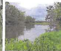
VIEW UPRIVER FROM PROPOSED FISHING PIER BIRD BLIND