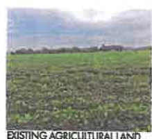
EXISTING AGRICULTURAL LAND