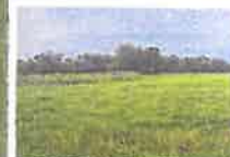
EXISTING WETLANDS FLOODPLAIN FOREST CLASSROOM