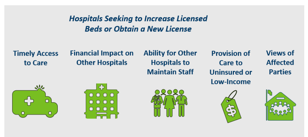
Figure 1: Public interest review general considerations

The Minnesota Legislature established a procedure for reviewing proposals for exceptions to the hospital moratorium statute to aid its deliberations and decision-making on proposed exceptions. Under this procedure, hospitals seeking an exception to the moratorium must submit a plan to the Minnesota Department of Health (MDH) for a "public interest review." The purpose of the public interest review is to provide the legislature with an independent, evidence-driven assessment by MDH as to whether the additional beds are or are not in the public interest. In conducting a public interest review, Minnesota Statutes, section 144.552 directs MDH to consider all relevant factors, but—at a minimum—it must consider: