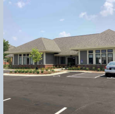
Southeast Regional Crisis Center