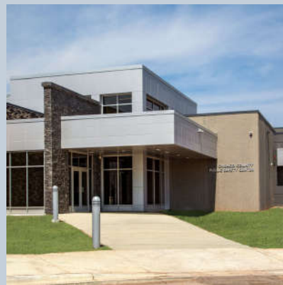
Chisago County Public Safety Center