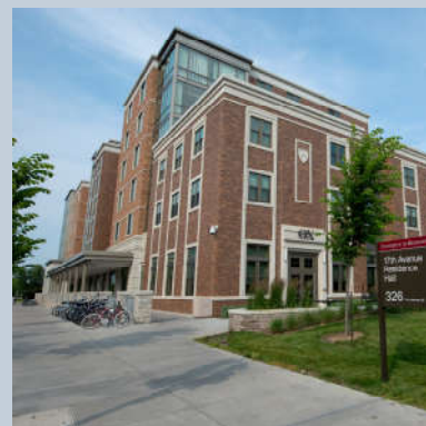
University of Minnesota, 17 th Avenue Residence Hall