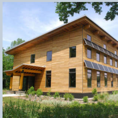
DNR Area Office, Glenwood