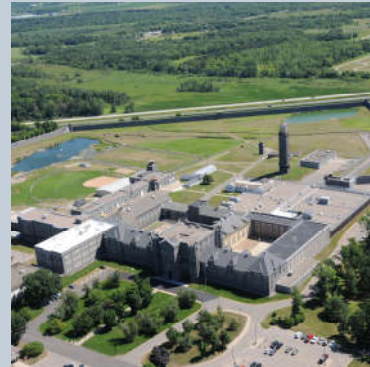
Minnesota Correctional Facility, St. Cloud

Disagreement and confusion about roles and responsibilities have resulted in limited program oversight and accountability.