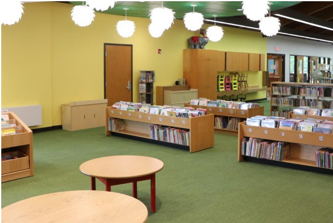
Cloquet Public Library, 2019 grantee