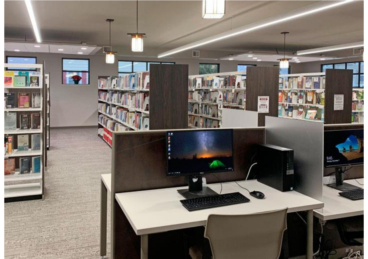
Kimball Public Library, 2019 grantee