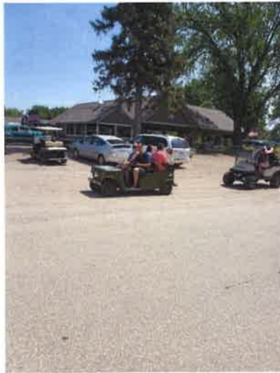
Live music from Whiteside Walls drew 250 attendees