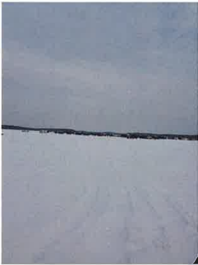
Holes for Heroes which drew 50 attendees