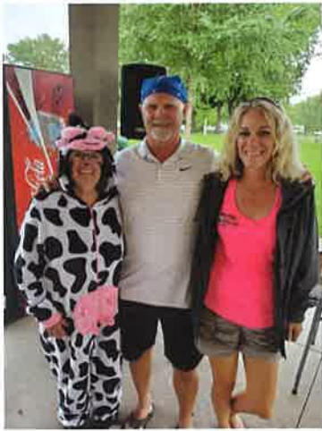
All the adults costume contest