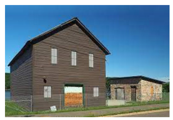
Bergstein Shoddy Mills Building