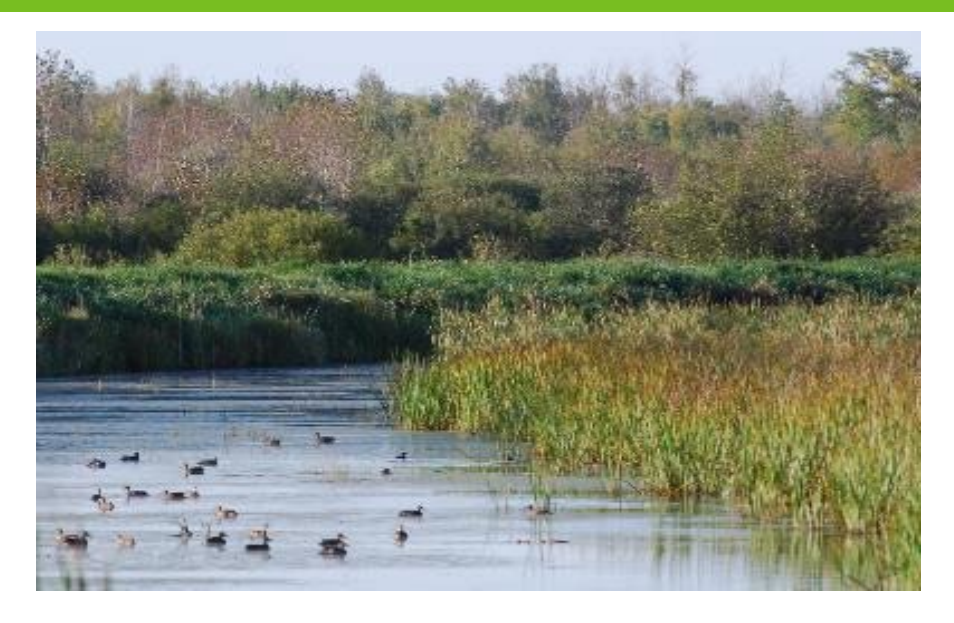
These funds will restore and permanently protect wetlands and generate wetland replacement (mitigation) credits for the Local Government Roads Wetland Replacement Program (LGRWRP) to meet requirements.