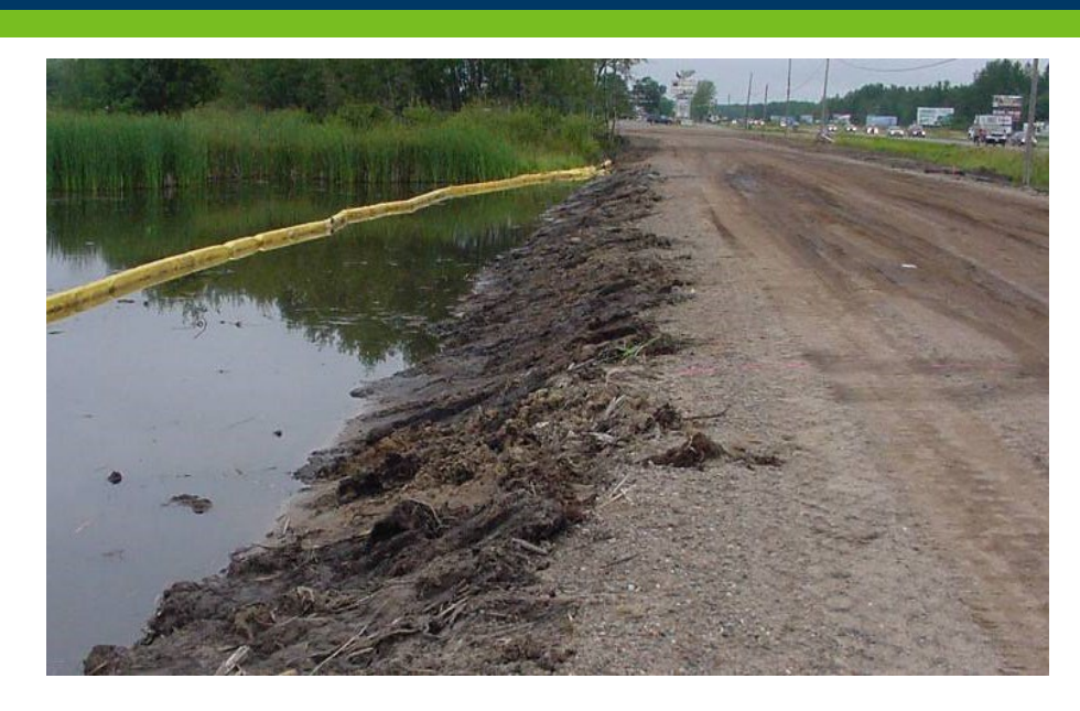
$2.5M in GO Bonds and $2M in GF is requested in 2024 to address BWSR statutory requirements to replace wetlands and wetland areas of public waters drained or filled by public transportation projects on existing roads.