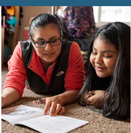
Early Intervention & Treatment 3350