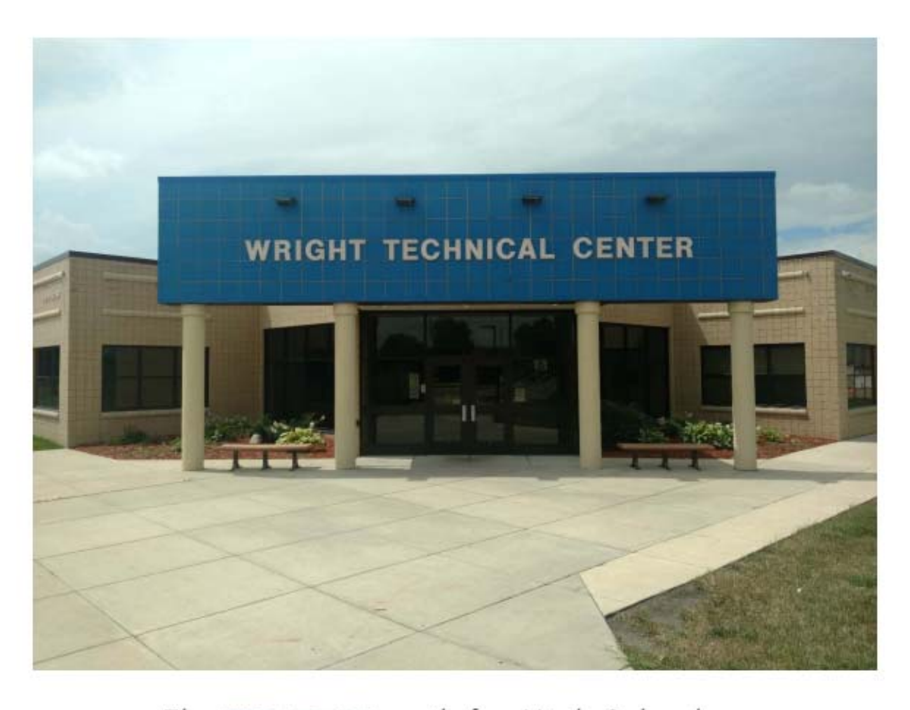
The WRIGHT path for High School