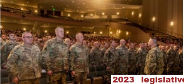
2023 legislative wins for Minnesota National Guard