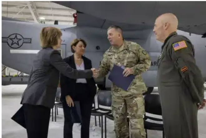
The 2023 state and federal legislative sessions can be described as a big win for the Minnesota Department of Military Affairs and the Minnesota National Guard