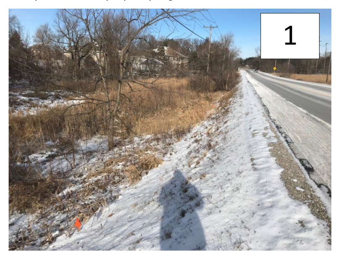
Narrow shoulder width – Bike/Pedestrian travel during winter months near impossible

Wetland floodplain area and steep slopes requiring boardwalk structure construction - $800,000 cost