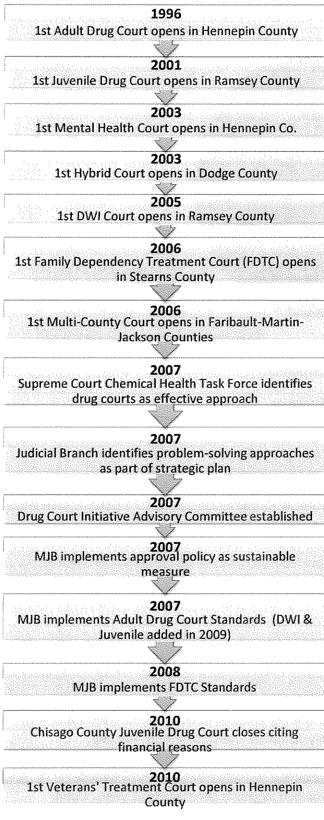
Figure 1: Drug & Mental Health Court Growth Timeline