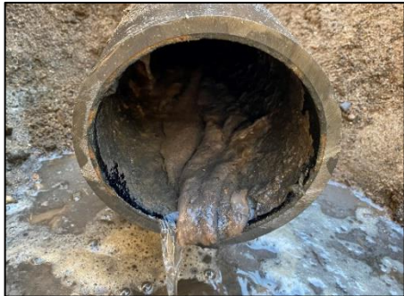
Photo: Distribution System Interior

A recent investigation found extensive bacterial slime within the City’s water distribution system.