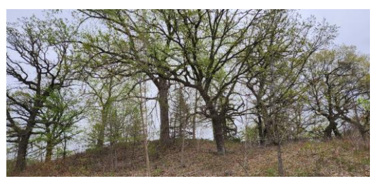
A hilltop savanna cleared of invasive buckthorn. Project by: City of St. Paul