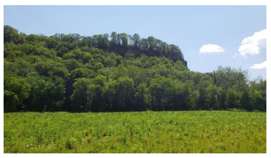
A newly restored prairie bordering Rattlesnake Bluff at Frontenac State Park. Project by: Minnesota Land Trust