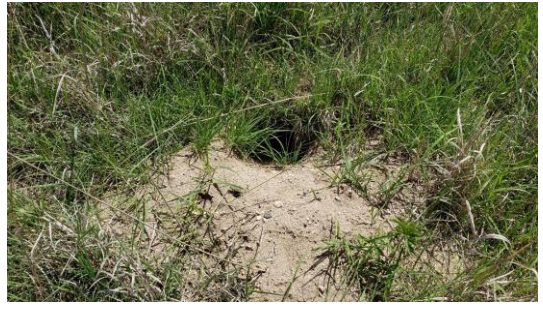
A den found at a newly restored site. Project by: Pheasants Forever