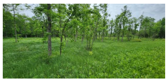
Diversity tree planting in response to Emerald Ash Borer. Project by: Leech Lake Band of Ojibwe