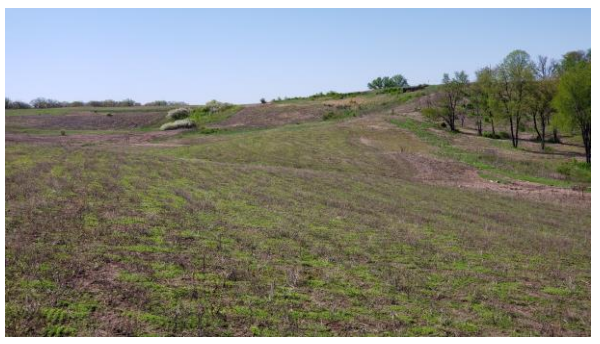
New prairie growth in spring at a large restoration site. Project by: Minnesota Valley Trust, Inc.