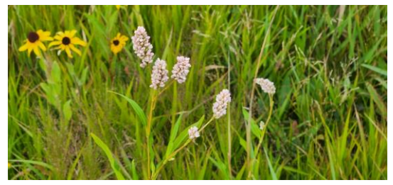
First flowers in bloom at a newly restored prairie. Project by: Three Rivers Park District