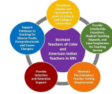
Coalition to Increase Teachers of Color and American Indian Teachers in MN